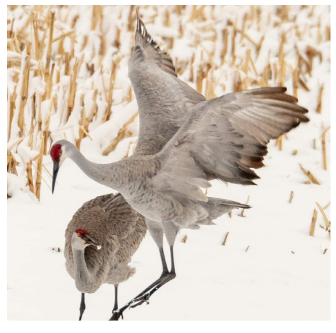
Sandhill Cranes