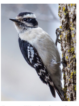
Downy Woodpecker

I always enjoy birding in January and February because I get to start a new year bird list, and I'm anxious to see what I'm lucky enough to find! Suddenly, even birds I see in my backyard are exciting. I can set up a feeder and it won't be long before Cardinals and Blue Jays are regular visitors. Next, I put suet or mixed nuts on a platform feeder and start seeing Northern Flickers, Red-bellied