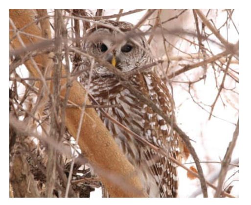
red Owl