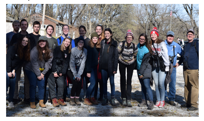
UNO Audubon Conservation Chapter field day

As we finish a year like no other, it is time to reflect and look to the future. Despite its chaos and isolation, 2020 was both busy and productive for the Audubon Society of Omaha.