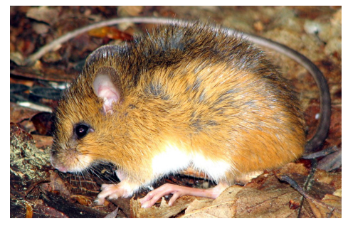
Meadow Jumping Mouse, Zapus hudsonius

Now the next, and I think the best, way to survive winter is to sleep through it. We have a small mouse-like critter