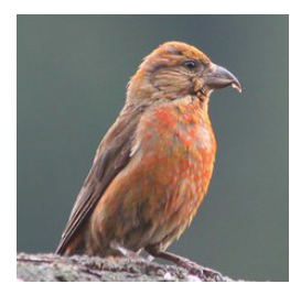
Red Crossbill

An exciting 2021 prospect for avid birders is a chance to see a rare finch. This winter has brought an irregular irruption of birds that are more common to the North, and we hope to see: Red Crossbills, White-winged Crossbills, Common Redpolls, Purple Finch, Evening Grosbeak, and Pine Grosbeak in higher than normal numbers. These finches are known to be highly nomadic,