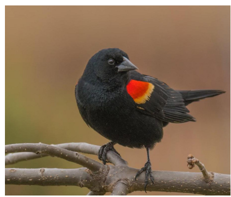
Red-winged Blackbird.

We would LOVE to see your bird photos and share them with our members! Please email them to Meadow Lark at asopublisher@gmail.com