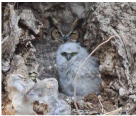
Great Horned Owl and Owlet.