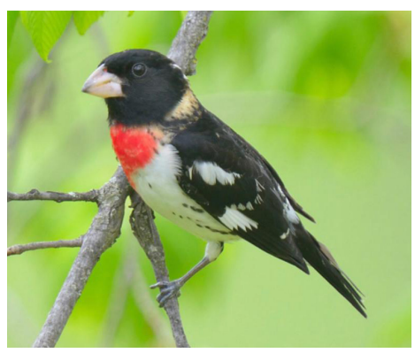
Red-breasted Grosbeak