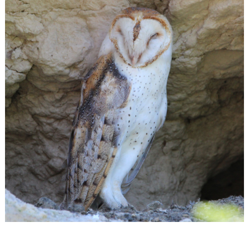
Barn Owl