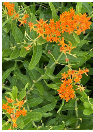
From left to right; Lead Plant, Coneflower, Milkweed

My adventure began as I turned left onto 14 Road, five miles north of Blair. Even before I topped the next hill I saw them: a sign that looked like a historical marker and a steel ladder straddling a wire fence. I parked along 14 Road, gathered my binoculars, camera and hat, and set off to find the orange Butterfly Milkweed my friend had photographed the week before.