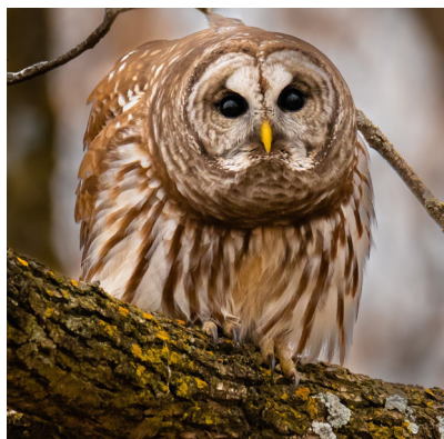
Barred Owl