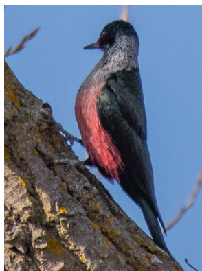
Lewis's Woodpecker

We need your bird photos! Please email them to Meadowlark at asopublisher@gmail.com