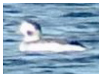
Long-tailed Duck

Most likely, inaccessibility or damage to natural habitats from last year’s flooding negatively impacted the number of birds found, as did the lower number of people counting. Special thanks to Rick Schmid for organizing the event, Neal Ratzlaff for leading the count and Candy Gorton for cleaning the ASO office and rounding up a pizza dinner for the participants.