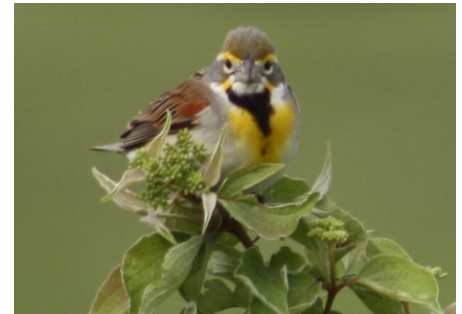
Dickcissel at Cuming City Prairie Preserve.