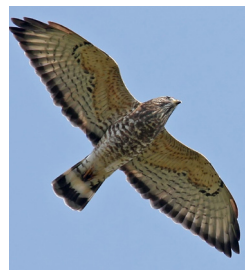
Broad-winged Hawk.

Raptor migration times can vary, sometimes greatly. A few "early bird" species include Mississippi Kites, which take wing in late August and early September in Nebraska, and Osprey and Broad-winged Hawks, which migrate mainly in September. You'll get a great view of these and other raptors at Hitchcock Nature Center just north of Crescent and Council Bluffs, Iowa. Need to ID a bird? If you have a smart phone, download the Audubon App; it's FREE and useful.