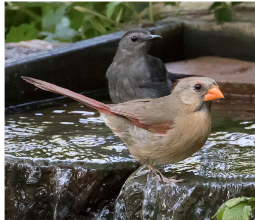
Catbird and female cardinal enjoy a dip.

Want us to feature your photos? Send them to Meadow Lark at asopublisher@gmail.com