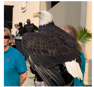
Large female Bald Eagle at National Audubon Convention in Milwaukee