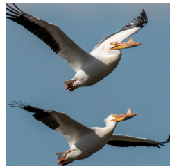
American Pelicans.

The annual "fall" migration of birds is actually somewhat of a misnomer. Many species of birds actually begin their trek south long before the date we humans mark as the autumnal equinox, which falls on September 23 this year. For example: