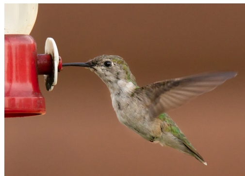
Hummingbird at feeder.