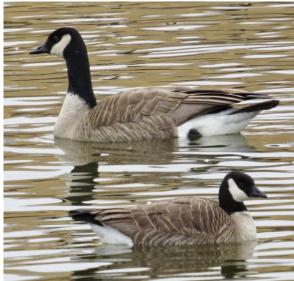
Canada Goose (top) and Cackling Goose (bottom)