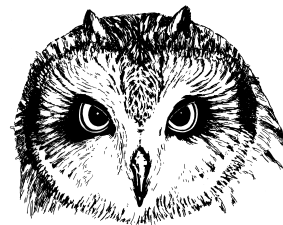
Raptor Recovery Nebraska™

If you find an injured bird of prey, please contact a Raptor Recovery Center volunteer at 402-731-9869.