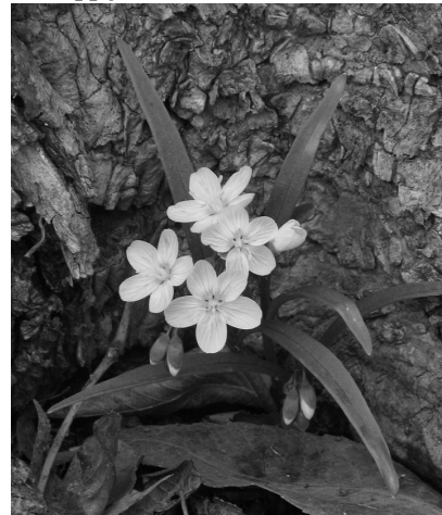
spring beauty

The starchy tubers of spring beauty can be eaten raw or boiled as a potato substitute. Their flavor is bland, and is often described as resembling chestnuts. In his book "Stalking The Wild Asparagus" Euell Gibbons wrote about eating them daily if not twice a day for several weeks. He said: "We tried them fried, mashed, in salads, and cooked with peas, like new potatoes. All these ways were completely successful, but, as regular fare, we preferred them just boiled 'in the jackets.' My friend grew so fond of this food that he was afraid he would experience withdrawal symptoms when the supply was exhausted."