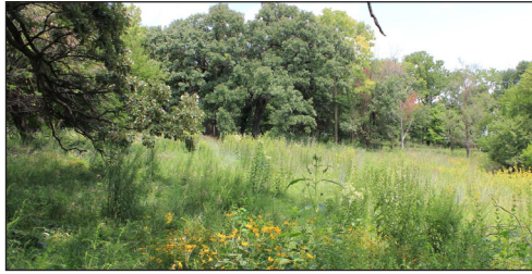
Camp Brewster Oak Savanna

Art show, youth and adult birding hikes, Earth Day booth, prairie