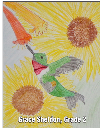
Grace Sheldon, Grade 2