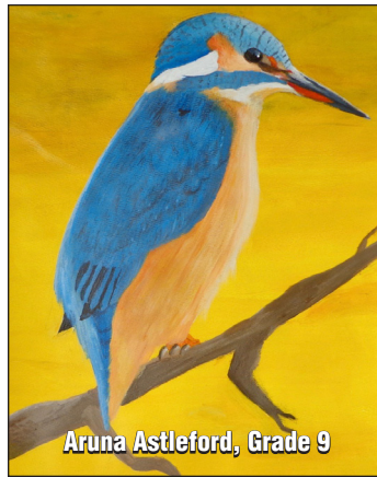
Aruna Astleford, Grade 9