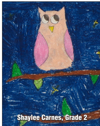
Shaylee Carnes, Grade 2