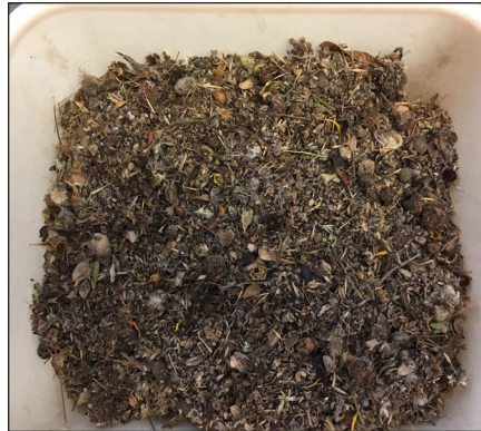
Processed seed ready for planting!

with a variety of blooms all growing season. Fontenelle Forest was very appreciative for the opportunity to partner with ASO and without this partnership the land prep would not have been possible, and with such a fertile seed source the Hilltop Savanna should be a beautiful reconstruction for years to come. If you are interested in helping ASO and Fontenelle Forest with the seeding of Hilltop Savanna look for updates on our calendar online for potential dates in early December.