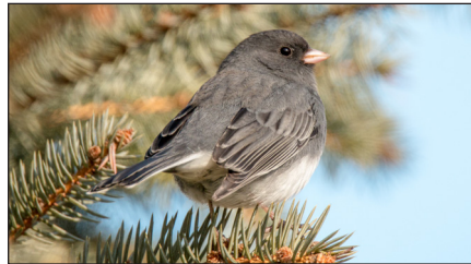
Dark Eyed Junco