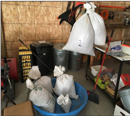
Final product from the ASO prairie harvest

Hello, fellow ASO members! I have a quick update on the Hilltop Project that I brought up last November/December in my presidents notes. ASO was gracious enough to allow Fontenelle Forest to use our Audubon Prairie for seed collection to help add some diversity to the seed mix for the Hilltop Savanna seeding. In modern day restoration or reconstruction, high diversity local ecotype seed is valuable in establishing a healthy system that is resilient to invasive species, good for the soil, and beneficial for wildlife. The ASO prairie is an excellent place to collect remnant forbs,