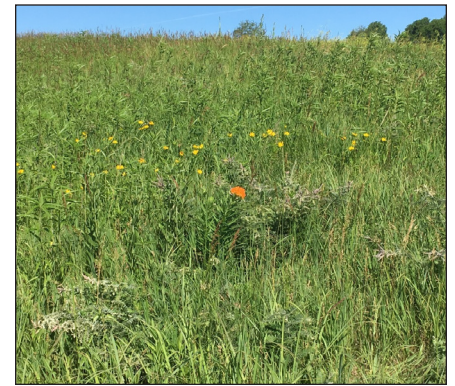
ASO prairie remnant hillside with a beautiful butterfly milkweed, lead plant, prairie phlox, prairie coreopsis