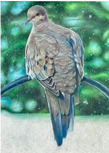
Elise W., Grade 10, Best of Show in Realism, Grades 7-12