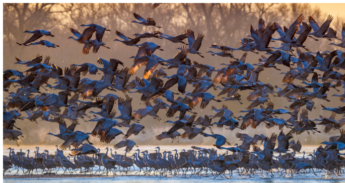
Sandhill Cranes on the Platte River by Diana Robinson

Despite the cranes' stable population, environmental conditions can be less predictable. The weekend I went to visit the cranes was exceptionally warm. High temperatures reached over 90 degrees and many people that I spoke with speculated whether the unusual temperatures were affecting the birds. Climate change has affected bird behavior on the Platte before, and there are questions about what migration will look like in the future. Experiencing a sunrise with the Sandhill Cranes was unforgettable, but it was also an important reminder to protect precious ecosystems like the Platte River. I hope everyone can experience seeing these amazing birds, not just next year but for many generations to come.