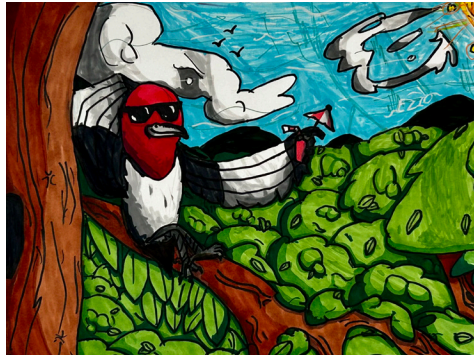
Ezio H.-M., Grade 8, Best of Show: Cartooning, Grades 7-12