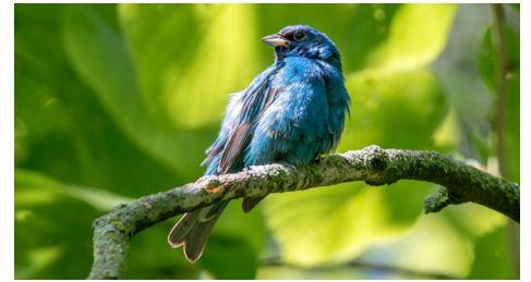
Indigo Bunting by Mike Benkis

If you learn one new song this spring, let it be the Indigo Bunting's. At first it might sound like a jumble of cheery notes. But listen again and you'll notice a pattern. Each phrase is repeated, so that each song is made up of a few doubled phrases. I might transcribe one song in phonetics like this: see it, see it; here, here; cheery, cheery . Once you know how to pick out those doubled phrases from the background of the spring bird chorus, you'll never miss it.