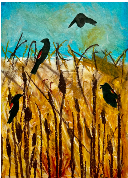
Sage P., Grade 3, Best of Show in Graphic Design, Grades K-3