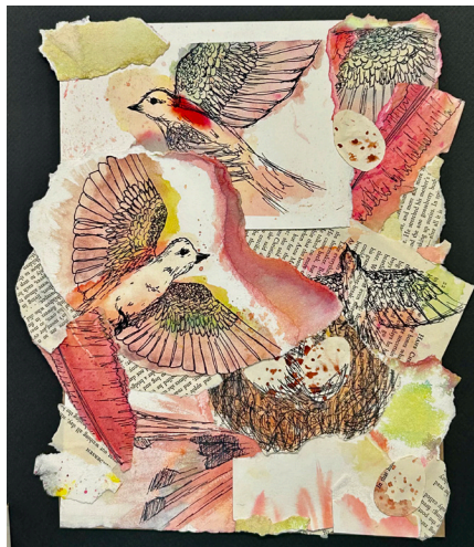
June T., Grade 9, Best of Show: Recycled, Grades 7-12