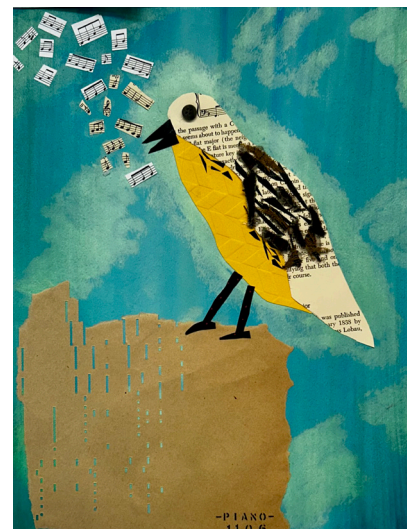
June T., Grade 9, Best of Show, Recycled, Grades 7-12