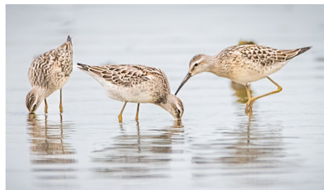
Sandpipers by Sheila Glencer

Dress in layers and wear sturdy waterproof shoes that can get dirty.