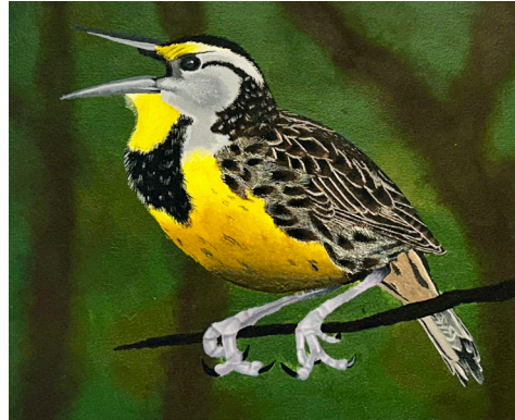
Clare W., Grade 10, Best of Show in Realism, Grades 7-12