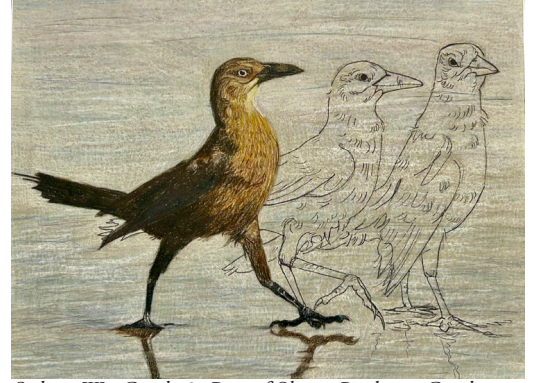
Sidney W., Grade 9, Best of Show: Realism, Grades 7-12