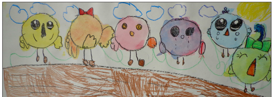
Shelby Steinkemper, Kindergarten