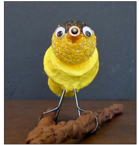
Luke Luddusaw, Grade 5