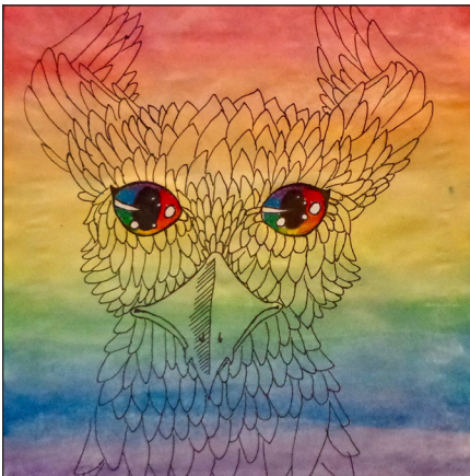
Lizzie Hill, Grade 6