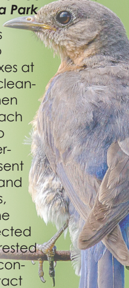
Eastern Bluebird

Audubon Society of Omaha is looking for a volunteer to help monitor about 34 bluebird boxes at Lake Manawa. Tasks include cleaning the boxes in March and then spending a couple of hours each week (April through August) to check boxes and record observations. Data results are then sent to Bluebirds Across Nebraska and Iowa Bluebird Conservationists, and are also compiled with the 33 years of data already collected at this location. If you are interested in helping with this important conservation project, please contact Audubon Society of Omaha at (402) 445-4138.