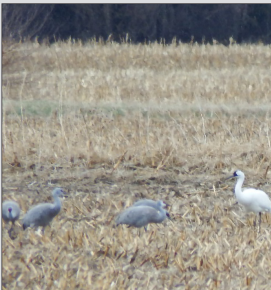
Whooping Crane with Sandhill Cranes

We will meet in the (Chalco Hills Recreation Area) public parking lot south of Highway 370 just west of I-80 at 6:20am and depart promptly at 6:30am. We will carpool, have lunch in Grand Island or Kearney and return by 8:00pm.