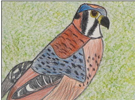
Trevor Potter, Grade 4

The Art Show will take place on Saturday, April 27 at a NEW location: Creighton University, Harper Center, 602 N. 20th Street in Omaha. Artwork of all students entering the contest (grades K through 12) will be on display from noon until 3:00 pm that day. The awards ceremony this year will start at 1:30 pm for grades K-8 and 2:30 pm for grades 9-12.