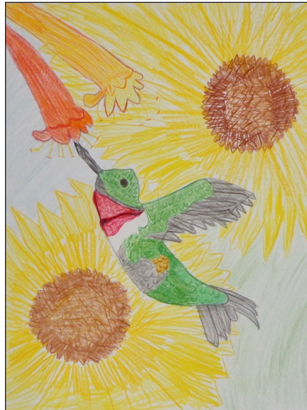
Grace Sheldon, Grade 2

The Student Art Show and Awards Ceremony draws a large number of attendees, so we also need volunteers to help with greeting students, their families